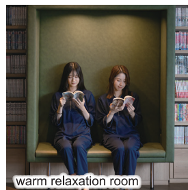
warm relaxation room