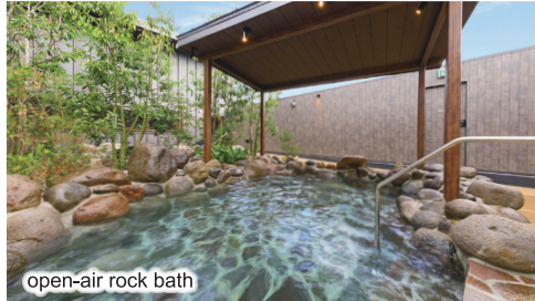
open-air rock bath