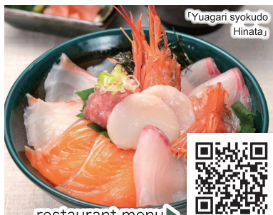
「Yuagari syokudo Hinata」