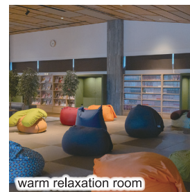
warm relaxation room